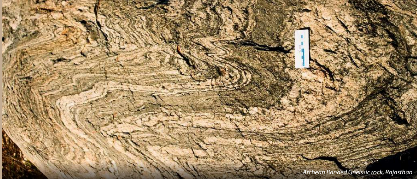
Archean Banded Gneissic rock, Rajasthan

experimental simulations of rock deformation, paleo-stress and strain analyses, active faults and active tectonic processes, evolution of fault systems, rheological behaviour of rocks, interdisciplinary research approaches, and fault-generated earthquake, tsunami and landslide hazards.