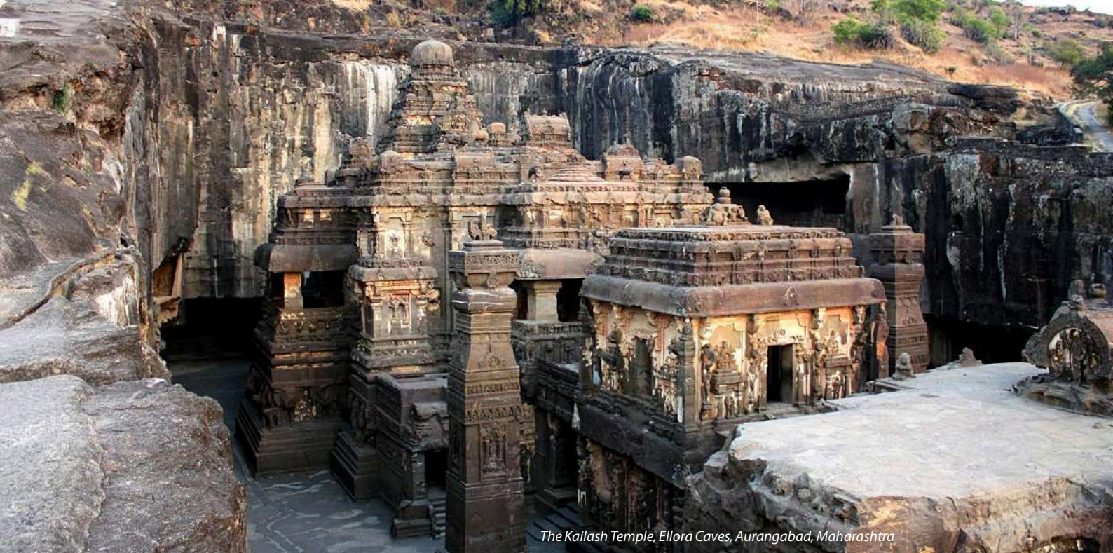
The Kailash Temple, Ellora Caves, Aurangabad, Maharashtra

sense, as well as more exotic but important classes of materials (e.g. kimberlites, alkaline magmatism). We particularly welcome sessions that integrate contributions from field observations, theoretical modelling, experimental petrology, geochronology, geodynamic modelling and geophysical data sets to develop a holistic view of igneous petrogenesis.