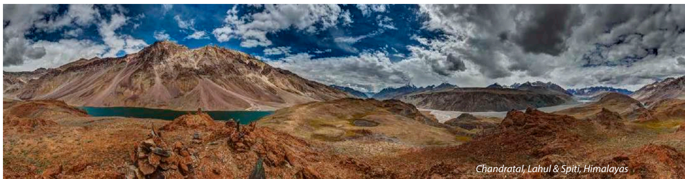
Chandratal, Lahul & Spiti, Himalayas