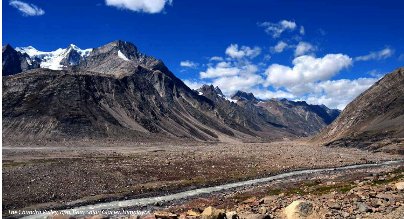
The Chandra Valley, opp. Bāra Shigri Glacier, Himalayas