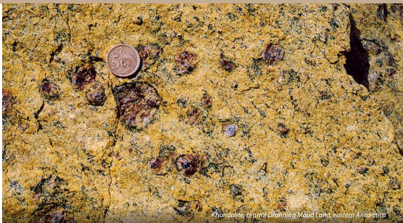
Khondalite, central Dronning Maud Land, eastern Antarctica

Metamorphic processes operative in different geodynamic settings can be understood from textural, mineralogical, compositional and computational studies on metamorphic rocks. Advances made in instrumentation related to imaging, chemical and isotopic in situ analysis in micro domains enable us to decipher cryptic clues which were overlooked earlier, and build more robust models of these processes. This has resulted in better understanding of the P-T-t estimates of metamorphic process that have implications in assessing geodynamics of different tectonic settings. This theme will invite symposia in wide ranging related topics of current interest in metamorphic petrology that include petrochronology, time scales and rates of metamorphic processes, diffusion chronometry, role of volatiles, fluids and melts, geochemical cycling and petrogenesis of metamorphic rocks in subduction zone settings, cooling and exhumation of UHT and UHP metamorphic rocks respectively, correlation of metamorphic processes with Plate Boundary deformation and geodynamics (and geodynamic modelling), transient thermal structure of the crust in case of UHT metamorphism, trace elements behaviour during metamorphism, field and laboratory observations with microanalytical and computational methods to understand processes that control development of mineral assemblages, textures and composition of metamorphic rocks.