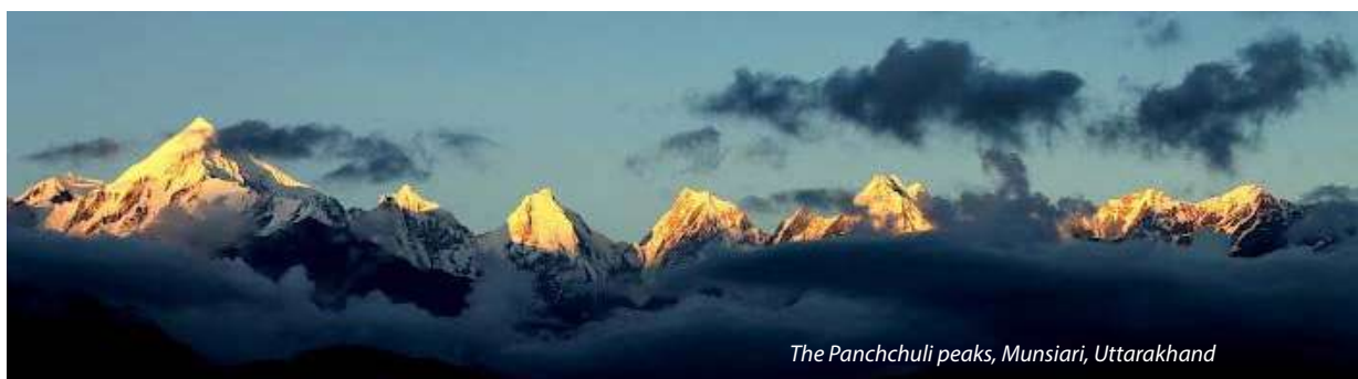
The Panchchuli peaks, Munsiri, Uttarakhand