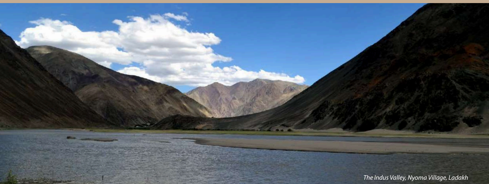
The Indus Valley, Nyoma Village, Ladakh