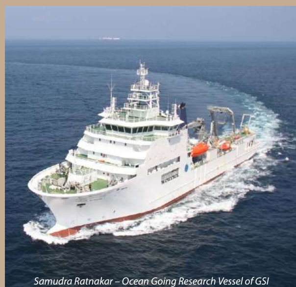
Samudra Ratnakar – Ocean Going Research Vessel of GSI

Of late there has been a resurgence of commercial and scientific interest in the prospecting and exploration for polymetallic nodules and sulphides and cobalt-rich crusts in the Exclusive Economic Zone (EEZ) seabed and beyond. The focus of this theme is on the geoscientific studies related to origin and occurrence of marine resources in diverse settings and their prospecting and exploration under the regulatory mechanisms prescribed by the International Seabed Authority. The theme encourages contributions on the scientific and technological challenges in marine mineral exploration, environmental aspects related to mining, the ecosystem dynamics at the locales of these resources and international laws that are being evolved by United Nations Convention on the Law of the Sea (UNCLOS) for regulation of exploration and mining.