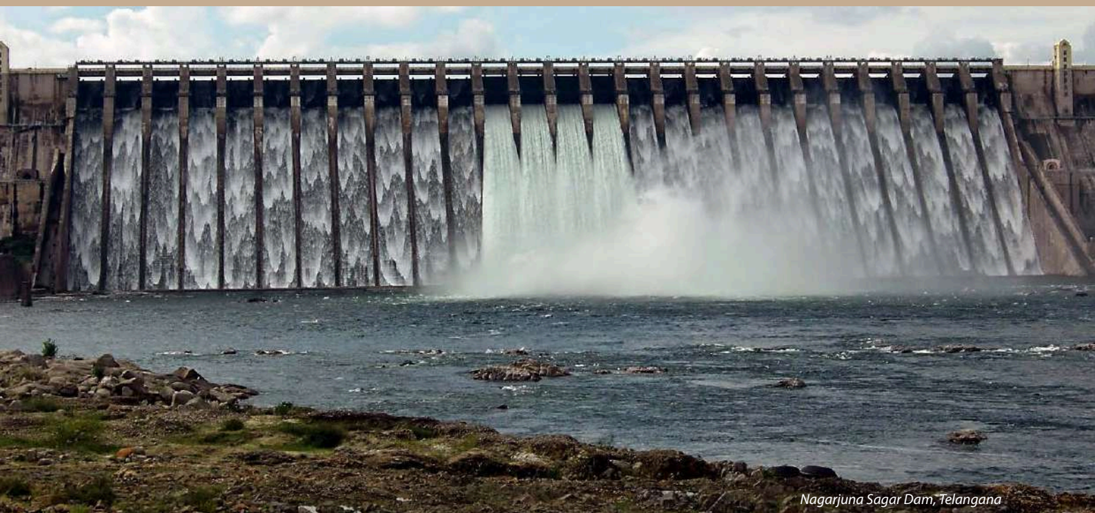
Nagarjuna Sagar Dam, Telangana

Geotechnical engineering and rock mechanics have become integral part of infrastructural development projects on transport and communication, energy sector, irrigation and drinking water supply, hazardous waste disposal etc. The symposia topics related to this theme include river valley development, urban planning and development, coastal development, hydro and nuclear power generation, hazardous waste disposal, transport and communication projects, slope stability and analysis including submarine slope failures, underground storage facilities, and any other developmental activities requiring geotechnical skill.