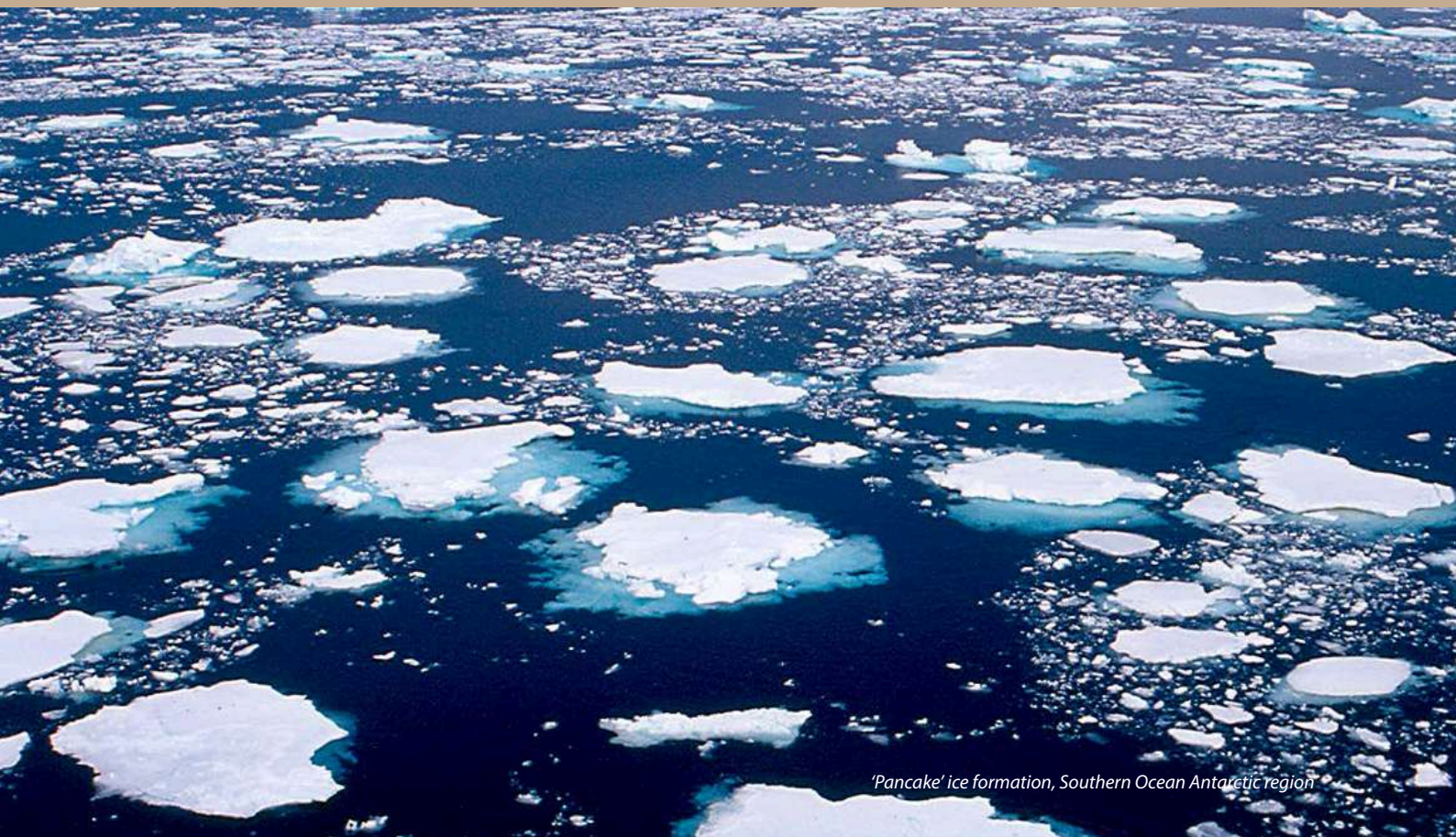
'Pancake' ice formation, Southern Ocean Antarctic region

The subthemes will include ocean atmosphere interactions and their reflections in the biology, chemistry and eventually the climate change.