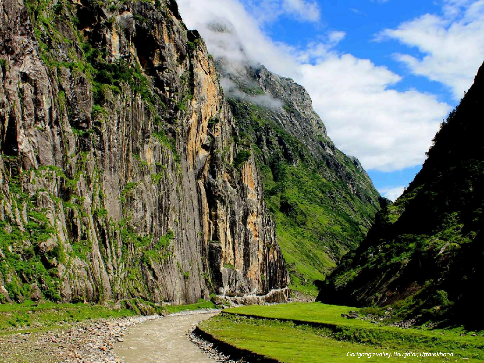
Goriganga valley, Bougdiar, Uttarakhand