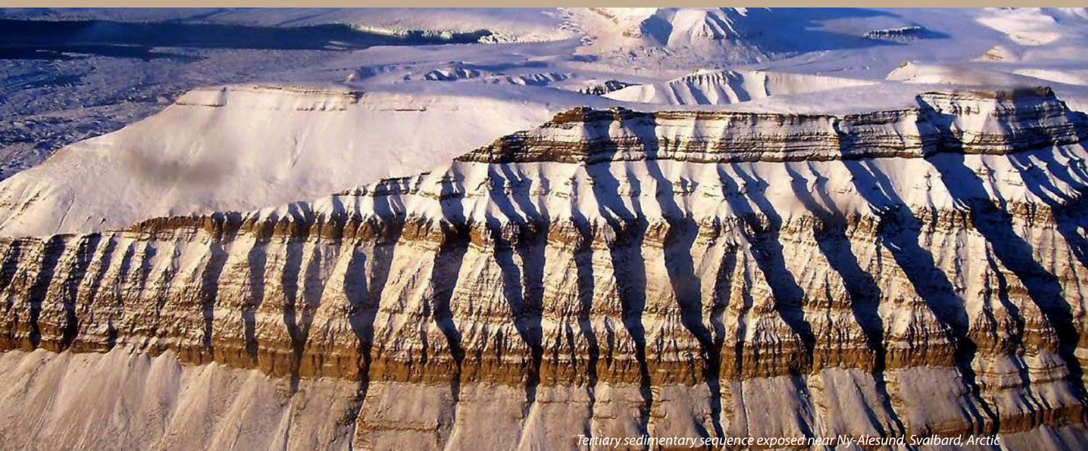
Tertiary sedimentary sequence exposed near Ny-Alesund, Svalbard, Arctic

Symposia in this theme will include ice-sheet behaviour through Cenozoic time, sub-ice morphology and geology, relate continent proximal marine sediment record to the adjacent land, understand and predict changes in the polar oceans and its impact on biota and link the past, present and future climate.