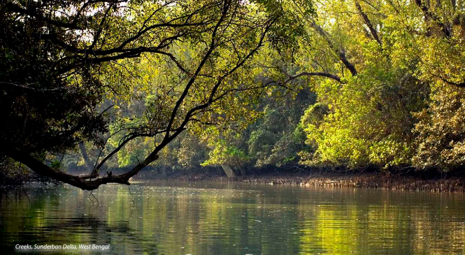
Creeks, Sunderban Delta, West Bengal