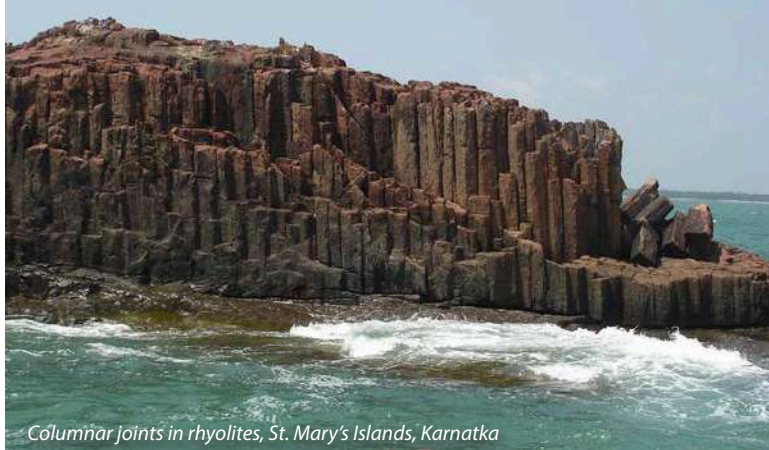
Columnar joints in rhyolites, St. Mary's Islands, Karnatka