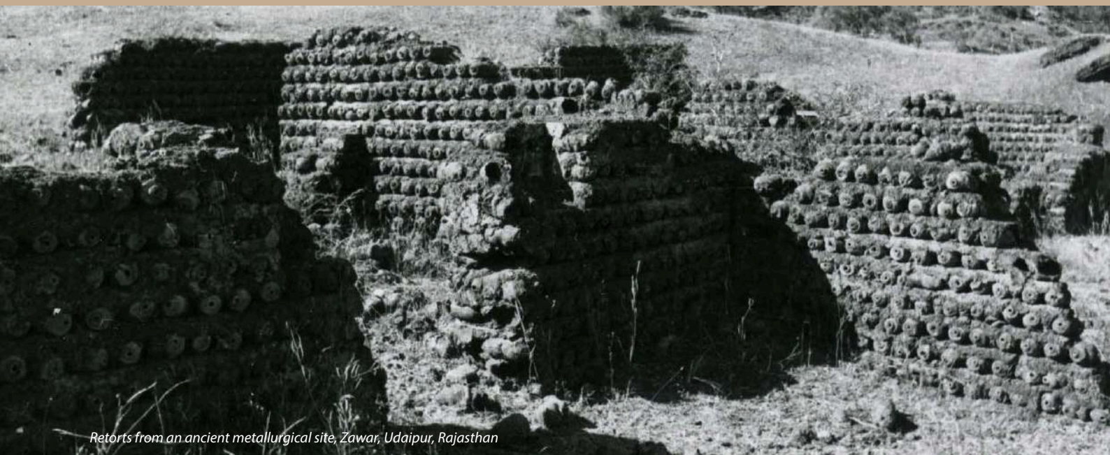
Retorts from an ancient metallurgical site, Zawar, Udaipur, Rajasthan

The subthemes will include various aspects of mineralogy, gemology, and Geometallurgy. Looking at the necessity of treating low grade lean ores it is proposed to include the subtheme on process technology.