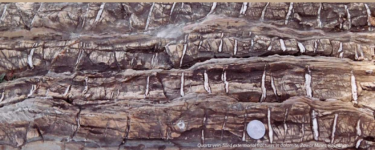
Quartz vein-filled extensional fractures in dolomite, Zawar Mines, Rajasthan

This theme aims to cover multiple sessions related to research in the holistic understanding of the accretionary and collisional orogenic process through the Earth's history, high-precision geochronology, rheological models, quantitative petrology and geochemistry.