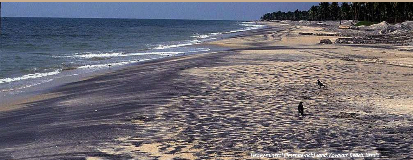
Heavy mineral (ilmenite-rich) sand, Kovalam Beach, Kerala

This subthemes in this thrust area will be related to geological availability of hi-tech and critical minerals, understanding their source characteristics and mineralogy with an objective to assess uninterrupted supply of these critical commodities.