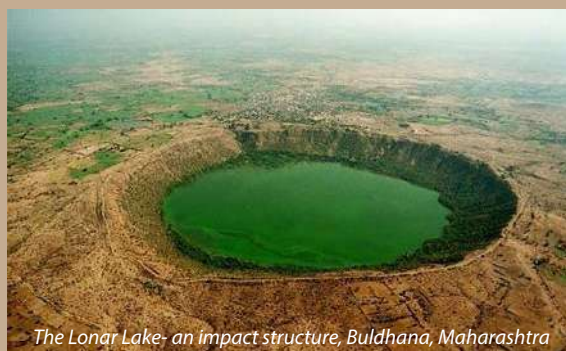
The Lonar Lake- an impact structure, Buldhana, Maharashtra

Extraterrestrial materials, remote sensing, satellite data, sample return missions offer a unique window to understand the planetary bodies. In addition, Earth-based collection of meteorites, micrometeorites, investigations on meteorite impacts and extinctions continuously augment our understanding of the solar system and its processes, including the evolution of life on our planet. The symposium offers an all-encompassing platform for presenting latest research on comets, asteroids, meteorites, micrometeorites, meteorite impacts and extinctions in the geological time scale, impact modeling, tektites and microtektites, planetary processes and astrobiology. In addition, the recent space missions by leading space agencies have provided new data sets for Moon, Mars and Venus. The theme will offer a platform to assess understanding of our celestial neighbours.